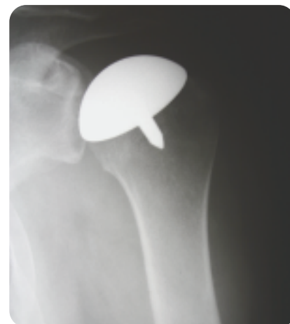
Figure 2 – Total shoulder replacement

Shoulder replacement offers reliable pain relief and improved functional results among patients with both