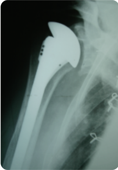
Figure 3 – Shoulder replacement with humeral-head resurfacing

rheumatoid arthritis and osteoarthritis of the shoulder joint. The ideal candidate is older than 55 years of age and will place lower demands on